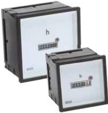
Elapsed Time/Hours Run Meters AC